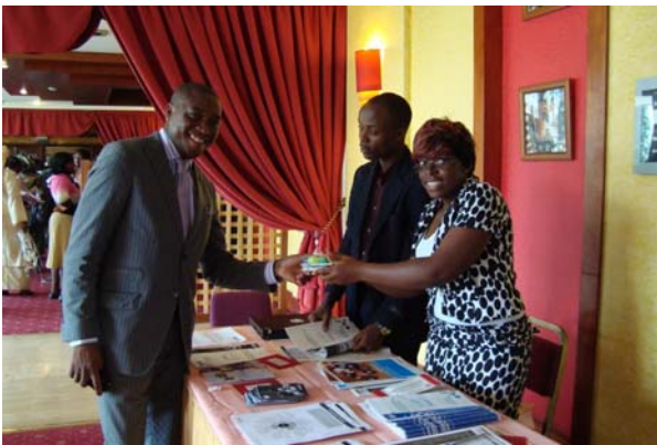
Distribution of ISOC's marketing materials.