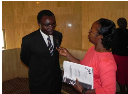
Interviews with Journalist: Who is Internet society? And What does it do? Why Its mission is important?