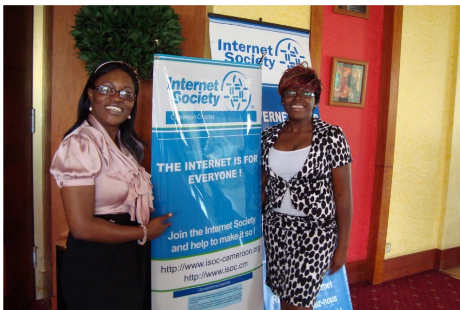
We need more girls in Internet Technical Structure like IETF . Girls, you are welcome!

Thanks to all who make this Kick-Off Conference a great success!