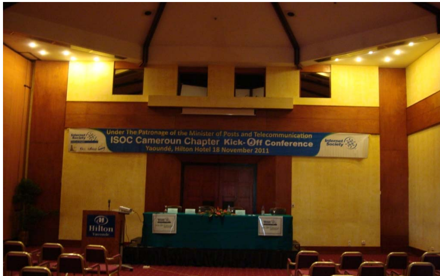
The Bouma C conference hall of the Hilton Hotel set for the event...