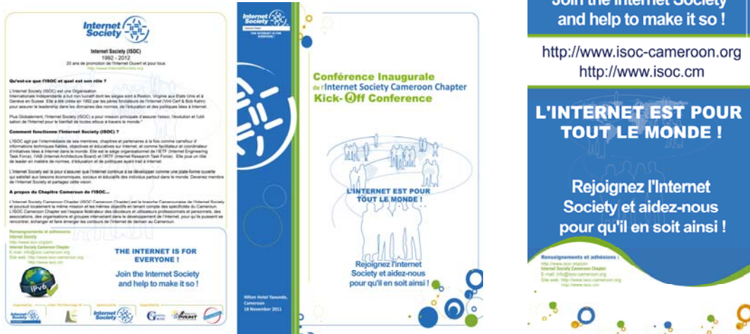
Some printing materials for the event.