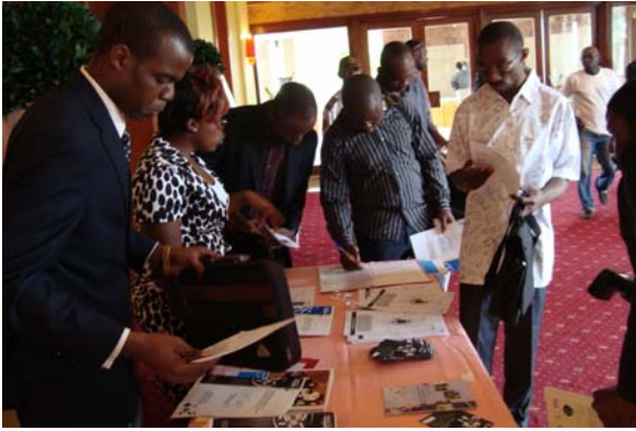
Informing and recruiting new members and volunteers for the Chapter.